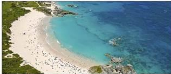
Bermuda's Horseshoe Bay